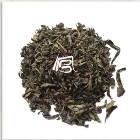
Green tea (OP)