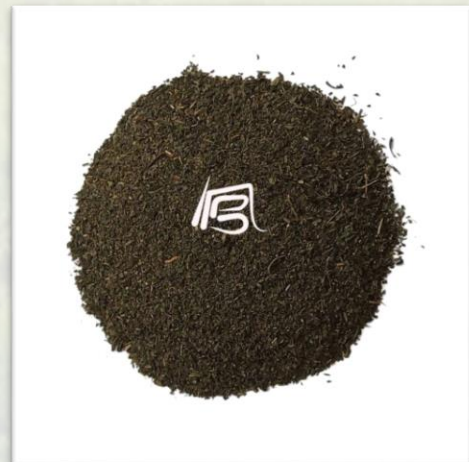
Green tea (DUST/1)