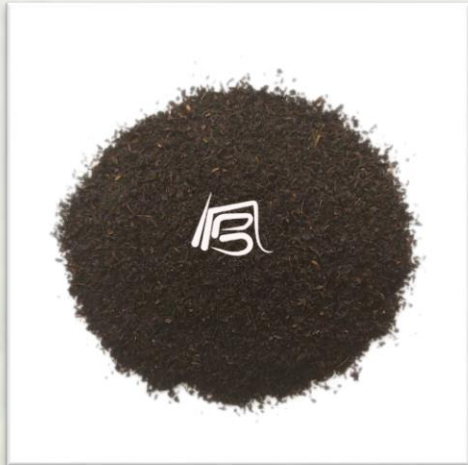
Black tea (F)