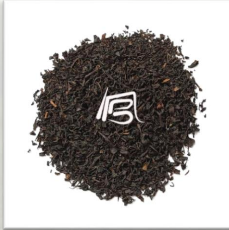
Black tea (BOP/A)