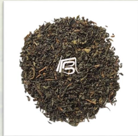
Green tea (FBOP)