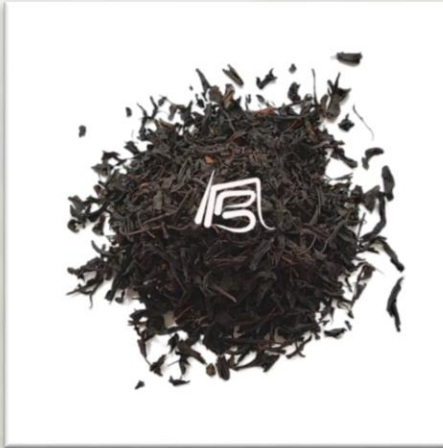
Black tea (OPA)