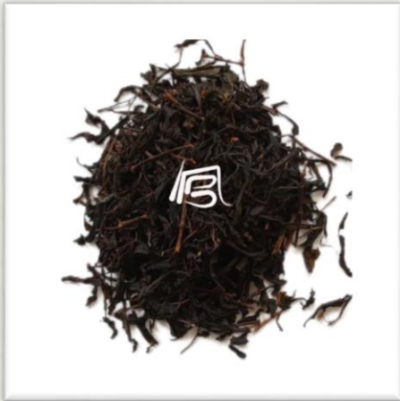
Black tea (OP)