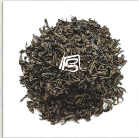
Green tea (OPA)