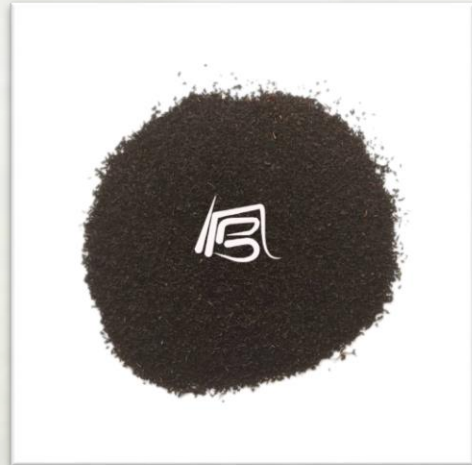
Black tea (BPF)