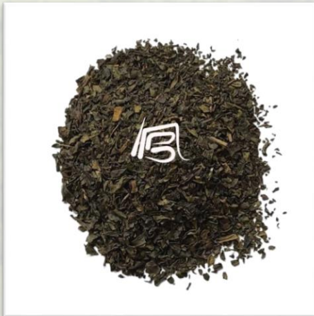
Green tea (BOP/A)