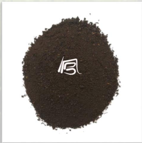
Black tea (DUST/1)