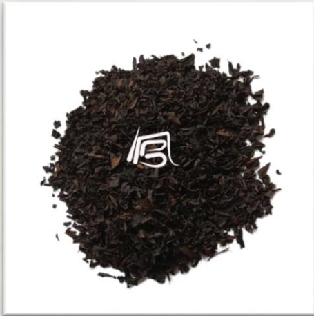
Black tea (FBOP)