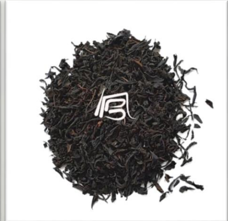
Black tea (OPA/A+)