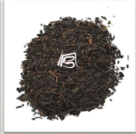
Black tea (BOP/B)